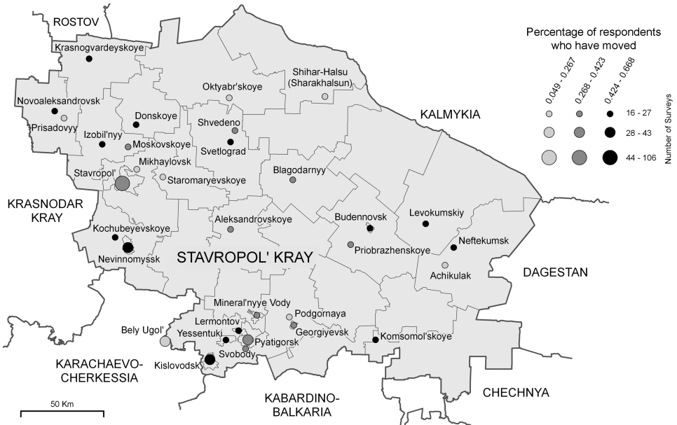
Fig. 2. Distribution of responses to question of whether the respondent has moved since 1990 in the 32 sampling points of Stavropol' Krai. Mean response is 38.4 percent.

some sense of the possible impact of tense inter-ethnic relations, we included Russian nationality as a variable, as well as measures of the current state and trend in ethnic relations as perceived by the respondent. Although we expected those respondents who reported a poor state of ethnic relations to be more likely to move in the future, the expected relationship with past moves was not evident. Finally, we included two measures that summarized personal conflict experiences (i.e., whether the respondent's life was influenced by the regional conflicts) and the respondent's overall view of the social, economic, and political situation in the kray. While there are clear expectations that people are more likely to move from negative situations, the relationship with previous moves is less clear because the current residence may not represent much of an improvement.