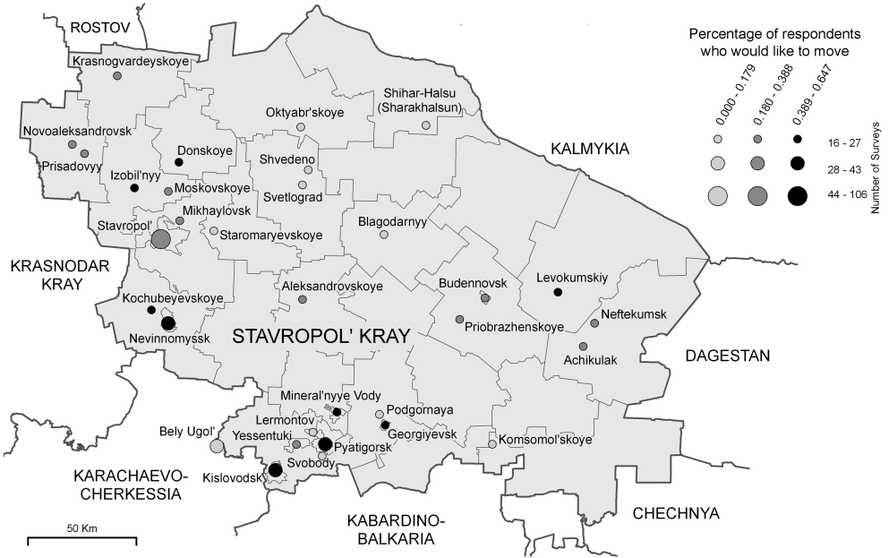
Fig. 3. Distribution of responses to the question of whether the respondent would like to move in the next two years in the 32 sampling points of Stavropol' Krai. Mean response is 29.6 percent.