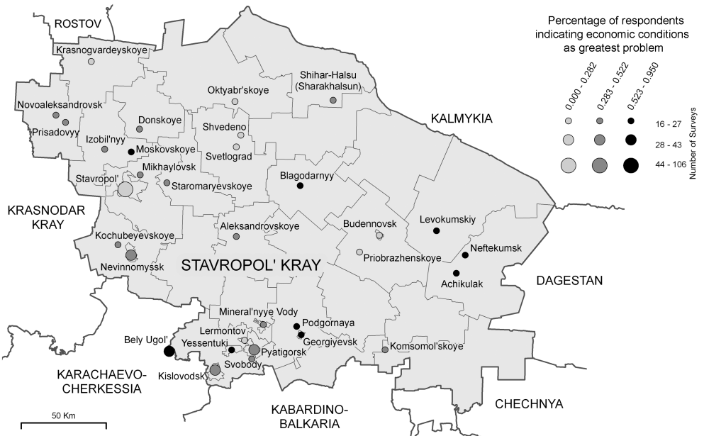
Fig. 4. Distribution of responses to the question regarding the main problems facing the peoples of the North Caucasus. The map shows the average response in the 32 sampling points of Stavropol' Krai to the option "lack of economic development." The mean response for the entire kray is 47.5 percent.